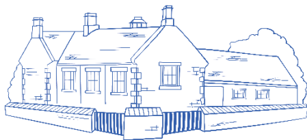
Uffington Church of England Primary School