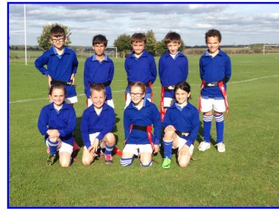
Year 3/4 Rugby team

This term the Y3/4 Tag Rugby team once again competed in the Stamford and District tournament; they were placed equal second. Netball league matches have taken place throughout this term with the team finishing in second place. The lacrosse team also won the Stamford and District tournament for the third year in the row and will now progress to the next round.