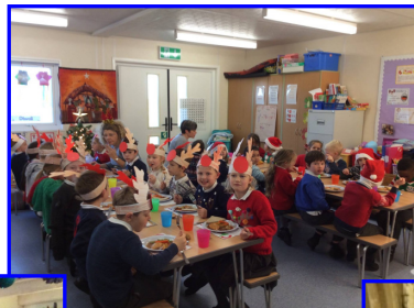
Christmas Jumper Day