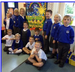
Y2's Harvest Display