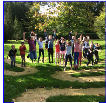
Fun at Burghley