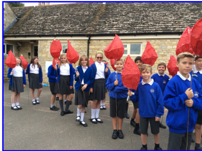
Stamford Georgian Festival