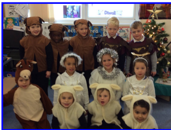
Ready for the Nativity

Christmas is always a special time at Uffington School and we have been very busy with a wide range of activities including a Christingle Service, the Nativity, carol singing at The Bertie Arms, Christmas Jumper Day to raise funds for Save the Children, Christmas lunch followed by the Winter Wonderland Run and a visit to the pantomime. The Carol Concert in Uffington Church was a great success as always and put everyone into the festive mood.